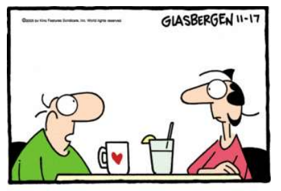
"Can we stop now? My arms are tired from holding up my end of the conversation!"

A woman has a constant desire to ______ her husband to everything in her life. She assumes